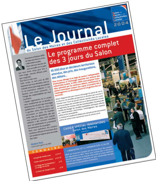
Format of Newsletter W232xH287 mm

Please note: as the number of advertisers is limited, orders will be processed on a first-come, first-served basis.